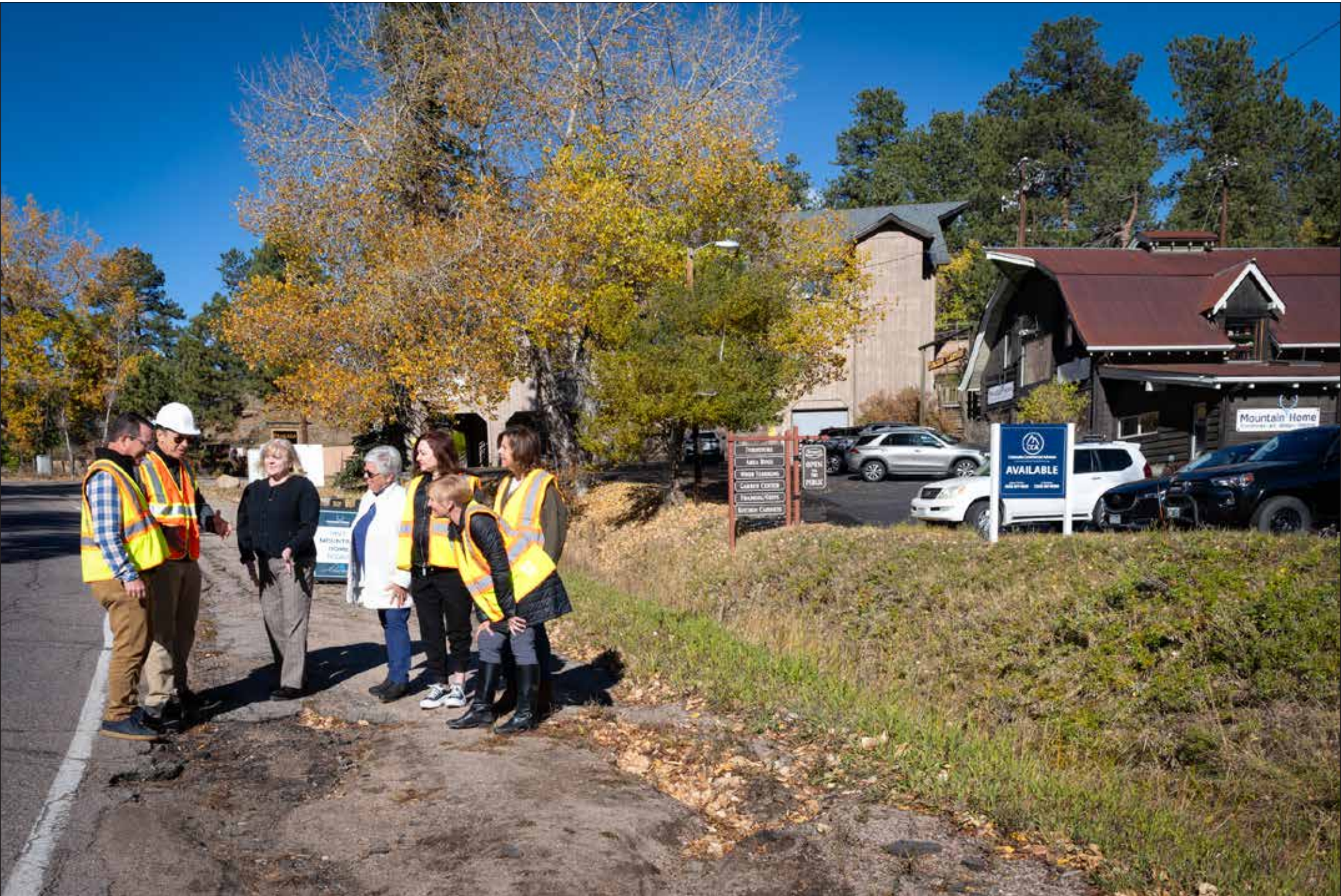
ELF board members view the shoulder area along Meadow Drive that will soon have a sidewalk extending to the Hiwan History Museum.