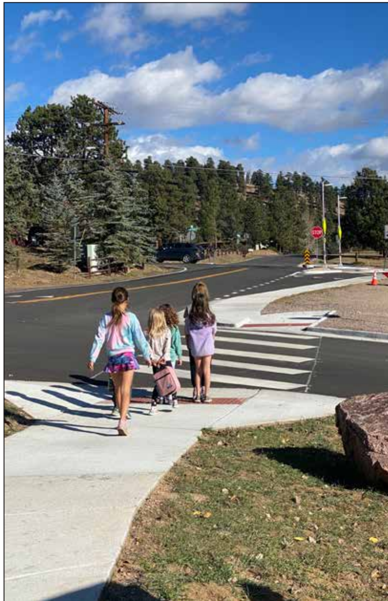
Extensive improvements to safety afforded by sidewalks and crosswalks near Wilmot Elementary.