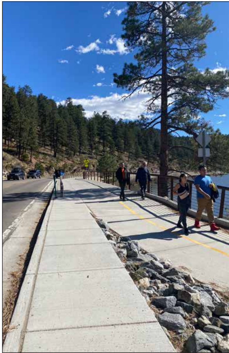
The new and improved Evergreen Lake North Trail.

With all the supporting information and documentation, and seeing what has happened, it makes it legitimate."