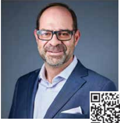
Scan for reviews